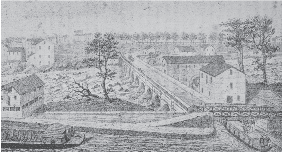
Erie Canal Aqueduct, Rochester, New York

Which of these resulted from the modification to the environment shown in this illustration?