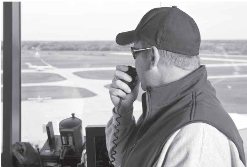
An Air Traffic Controller Talking to a Pilot Landing a Plane

(18) Eventually you'll begin to get close to your destination, and the responsibility for your plane will be handed back over to a local control tower. (19) There, controllers will be ready to make sure that our plane lands in an orderly fashion.